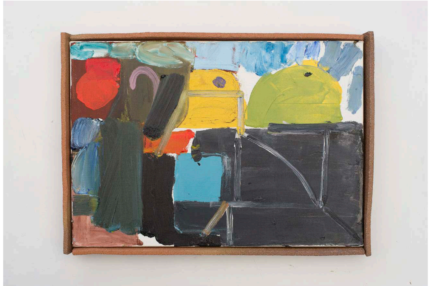
#0103 (2018) oil on linen, earthenware frame 39 x 54.5 x 5 $5,500