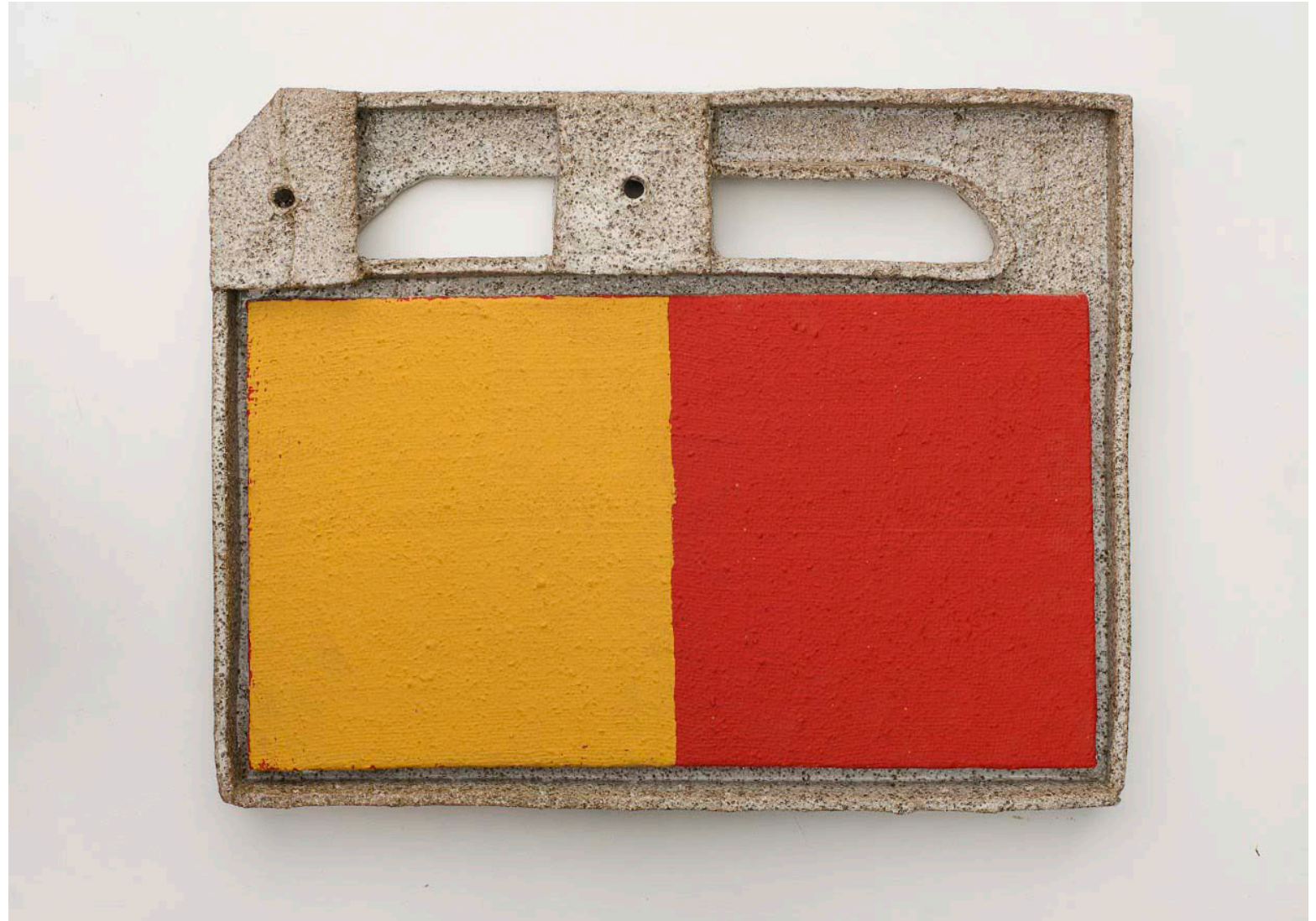
#0100 (2018) acrylic on jute, mounted on ply, glazed stoneware frame 53 x 41 x 5 cm $6,000