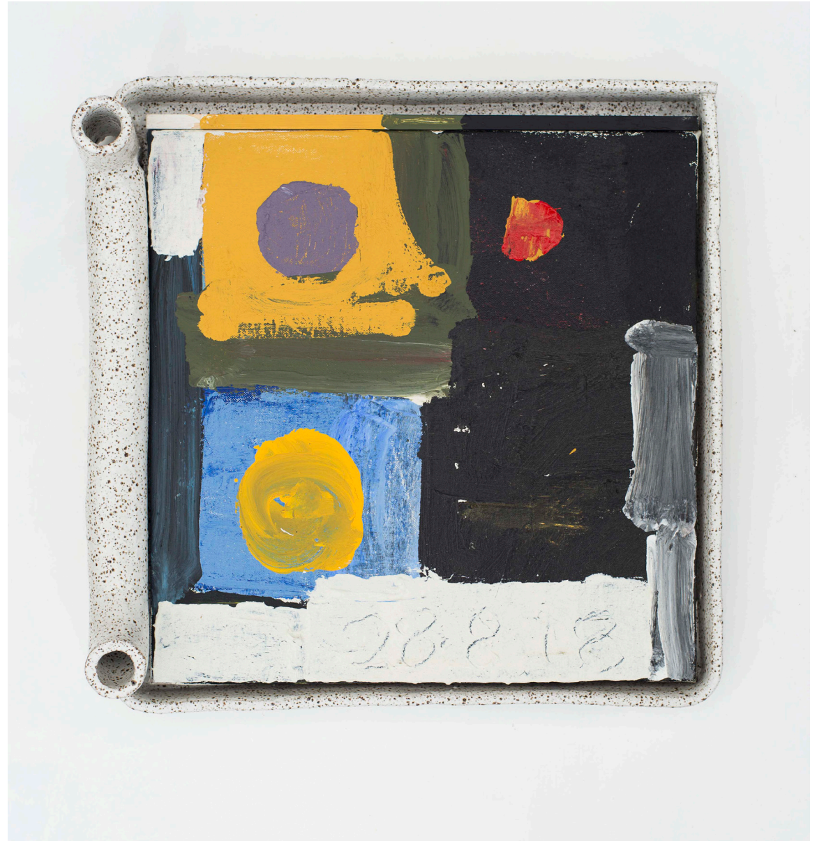
#0094 (2018) acrylic on linen, wood and glazed stoneware frame 44 x 43 x 11 cm $5,500