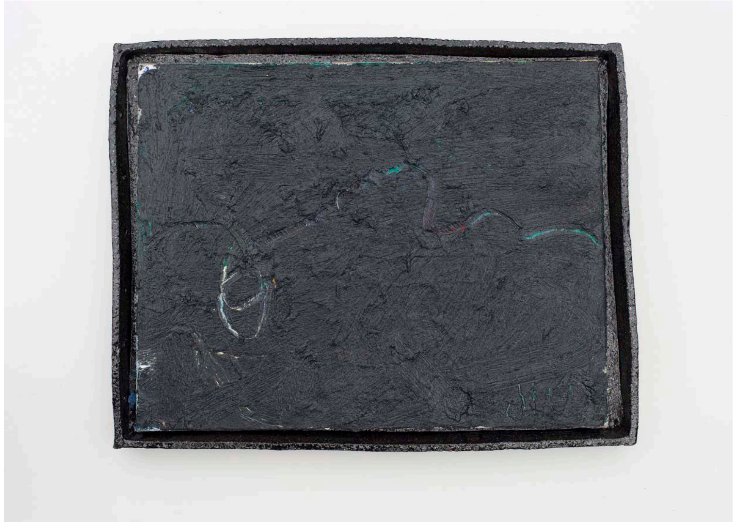
#0106 (2018) oil on linen, glazed stoneware frame 40 x 51.5 x 5 cm $5,500