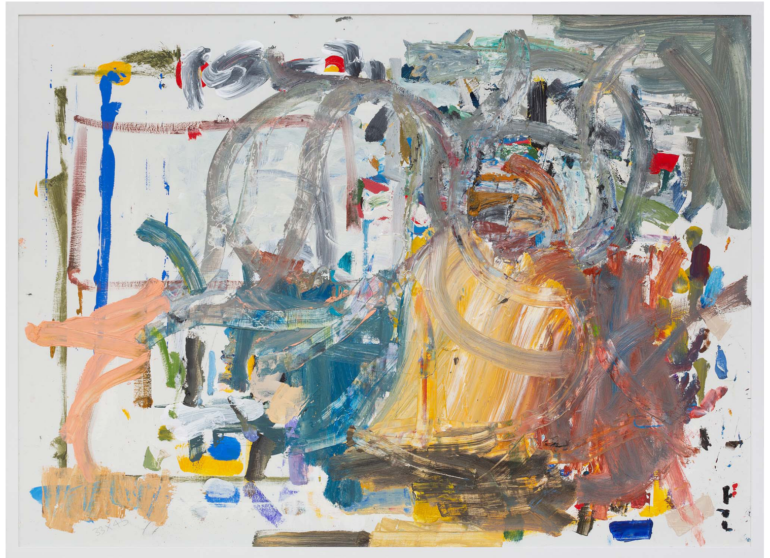
Untitled (2018) oil painting on board 92 x 125.5 cm $6,000