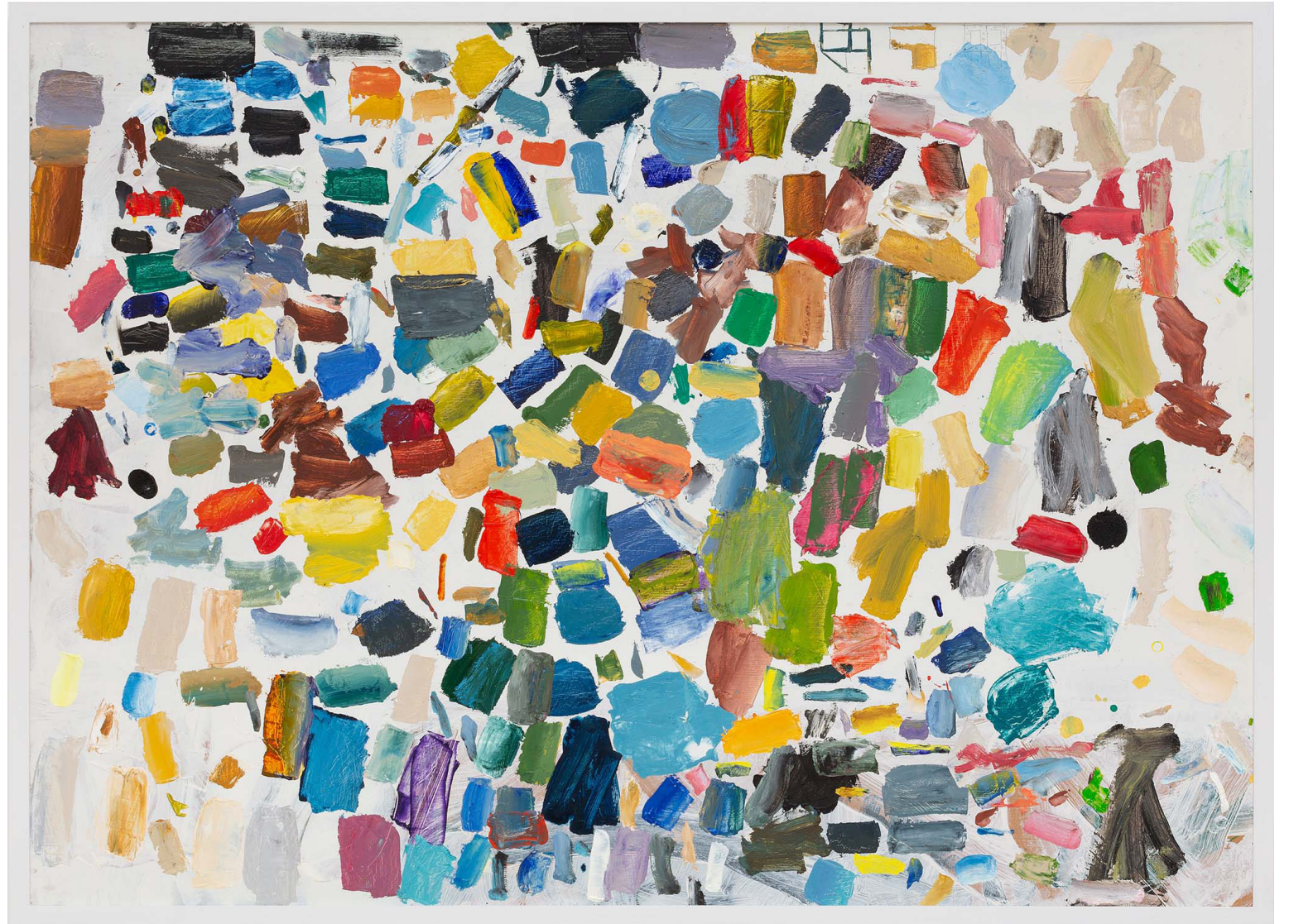
Untitled (2018) oil painting on board 92 x 125.5 cm $6,000