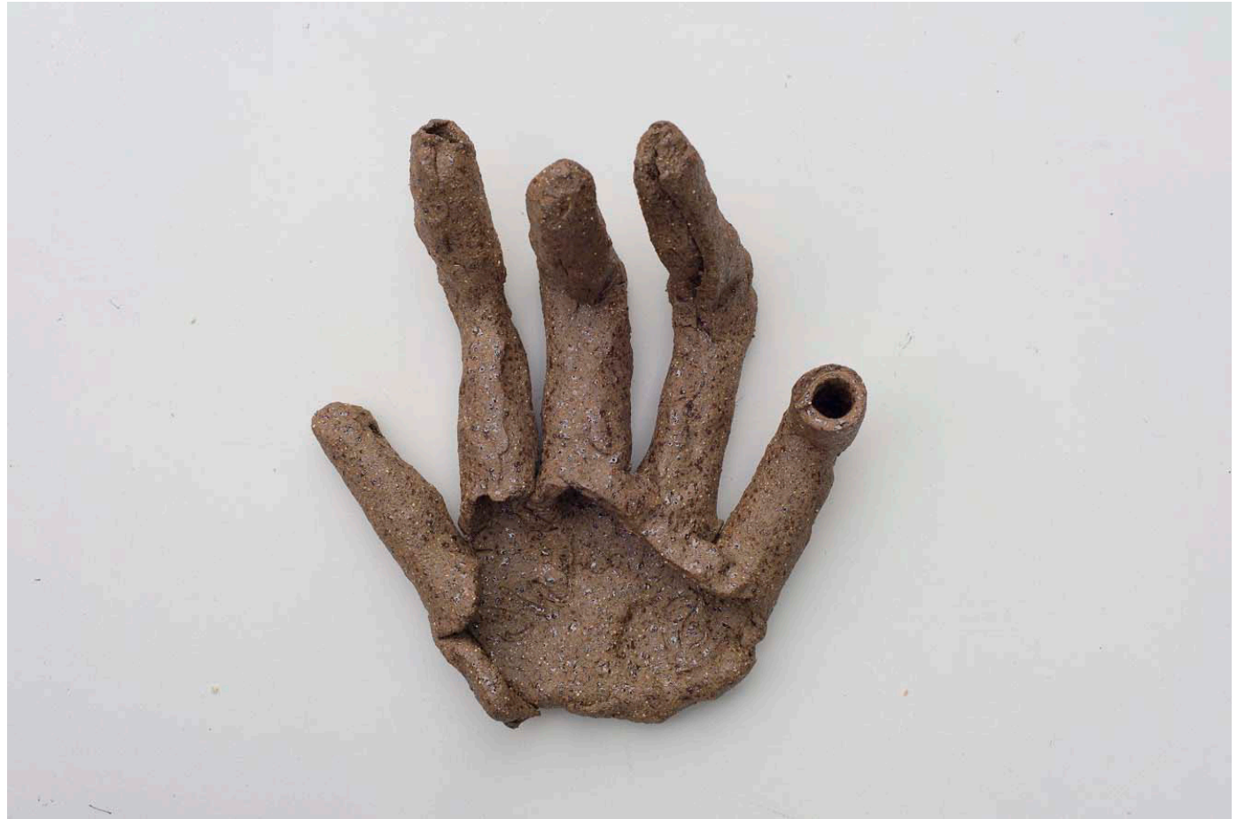
Hand (2018) stoneware 24 x 22 x 10 cm $POA