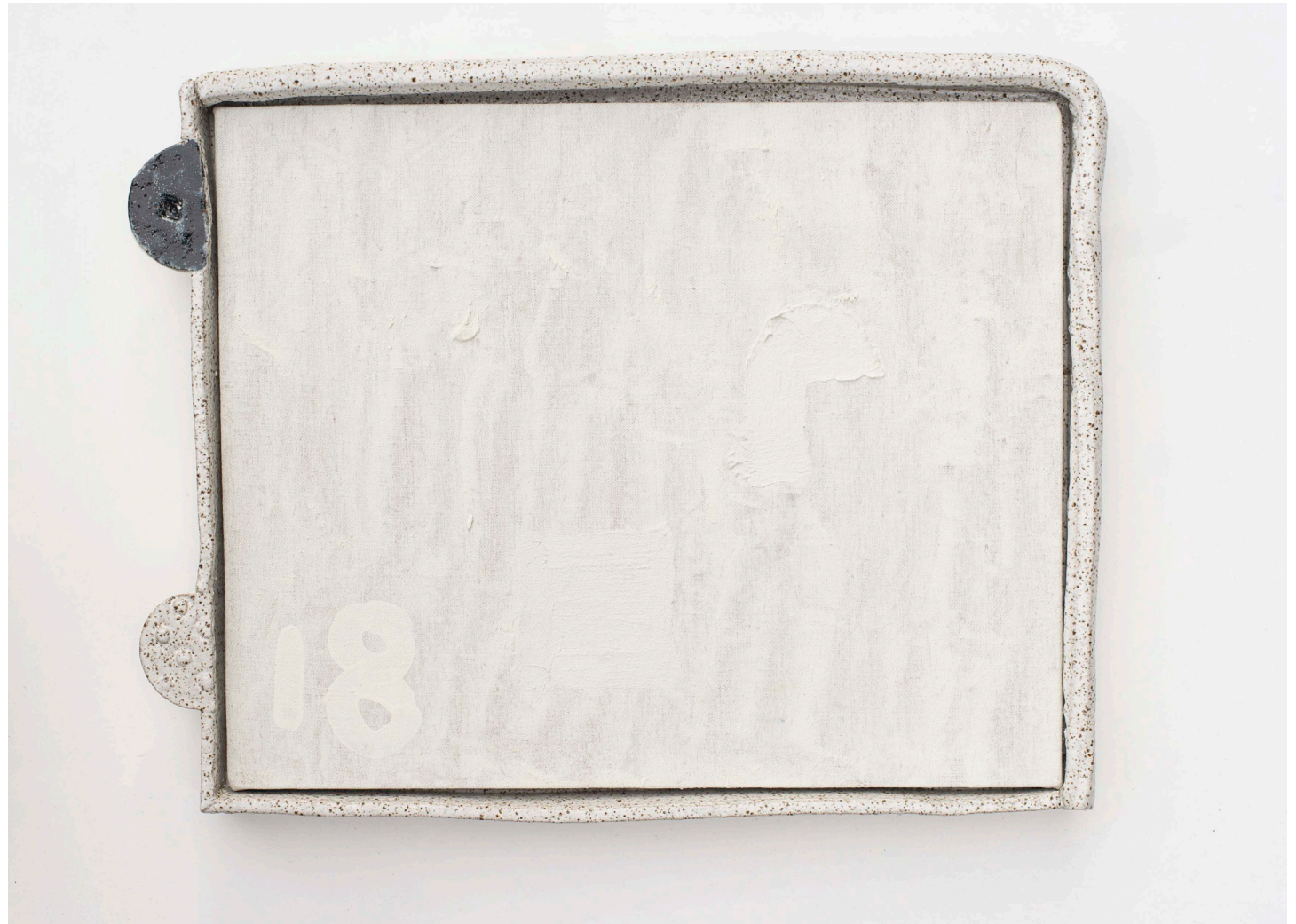
#0091 (2018) acrylic on linen, glazed stone- ware frame 43.5 x 56 x 5 cm $5,500