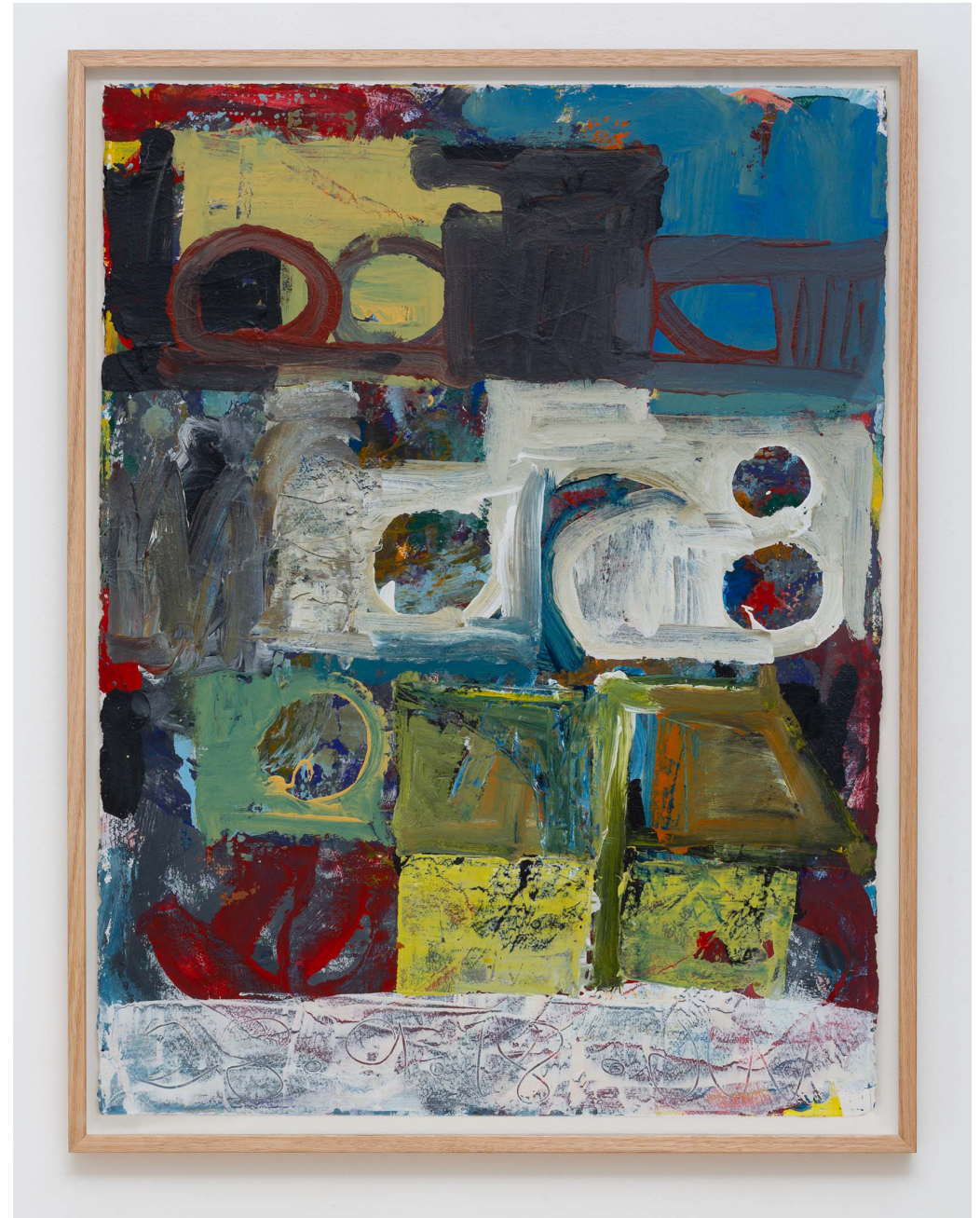
Untitled (2018) acrylic on paper 82 x 62 cm (framed) $4,000